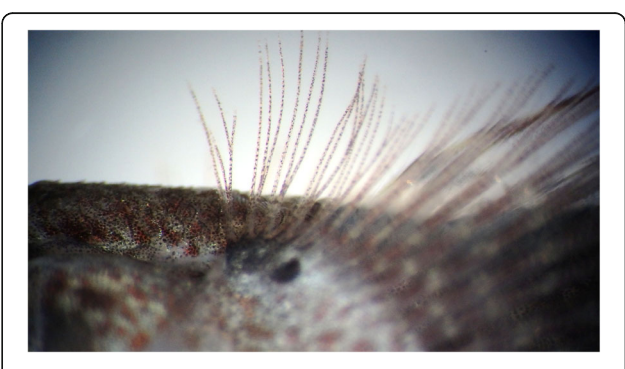
Fig. 3 Free rays on the dorsalmost pectoral fins, MFD-1231, 34.8 mm SL

Bathygobius hongkongensis inhabits rocky shores in tropical and subtropical regions such as Hong Kong,